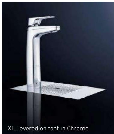
XL Levered on font in Chrome

Instant boiling, chilled & sparkling filtered water