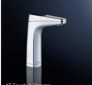
XT Touch in Chrome * To order a touch tap change Product code on page 2 from L to T