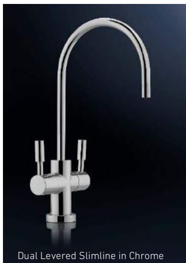
Dual Levered Slimline in Chrome

Instant chilled & sparkling filtered water